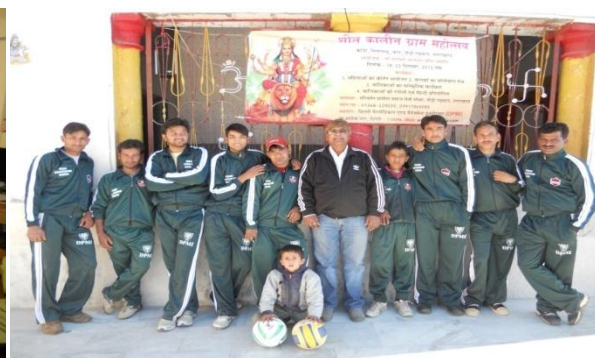
Sports Team of Parivartan Grameen Samaj Sevi Sanstha