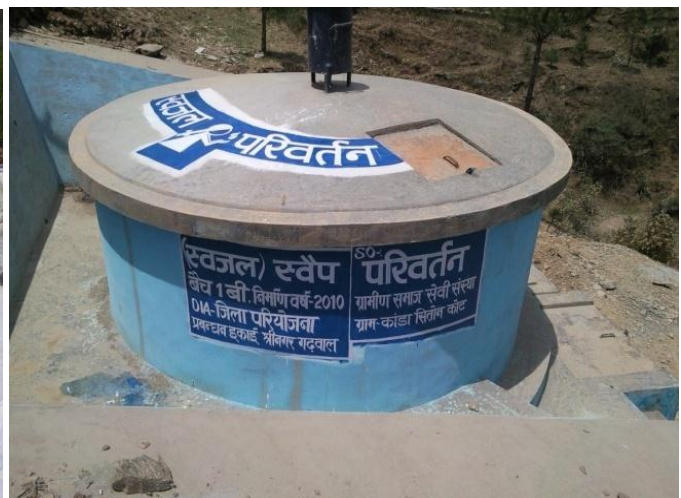
Mandir Chowk and Drinking Water Storage of Kanda Khalsa, Kot, Pauri Garhwal