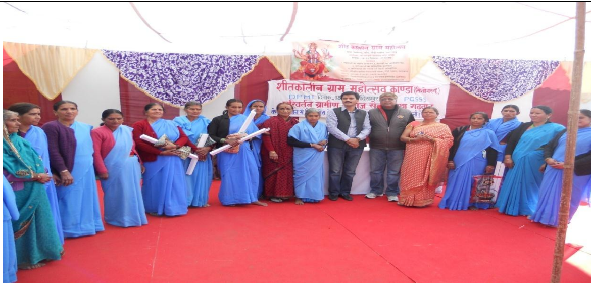
Cultural Team of Parivartan Grameen Samaj Sevi Sanstha